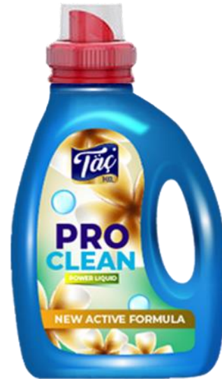
Liquid detergent 1.5 litre