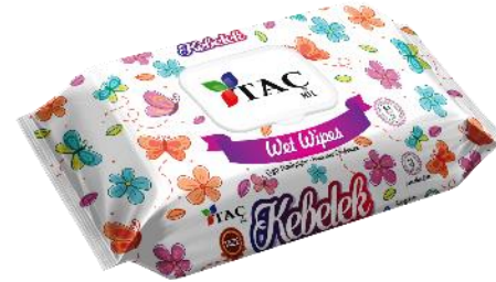
KEBELEK wet wipes

Everything related to appearance and formulation of "Keşde" wet wipes were specially chosen and designed corresponding to our tradition and then started to production.