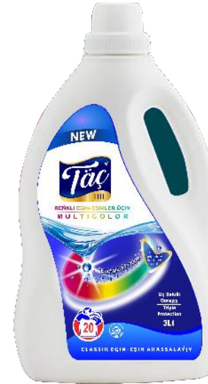
Liquid Detergent 3 litre