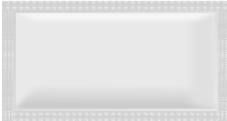
Size: 6 cm * 10cm

Our custom printed wet wipes offer unique opportunity to promote your brand with customized packaging. We'll print your logo, slogan, specific promotional message with up to 4 colors on the packaging for each individual wrapped wet wipe.