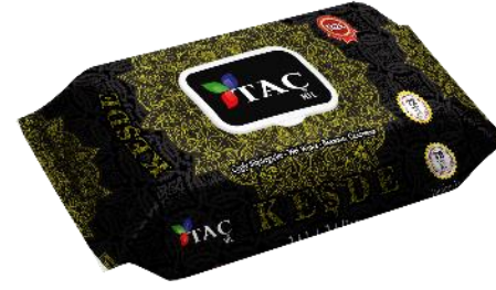
KEŞDE wet wipes

Deionized Water, Cetearyl Isononanoate, Ceteareth-20, Cetearyl A, Glyceryl Stearate, Glycerin, Cetyl Palmitate, Ceteareth-12, Cocoamidopropyl Betaine, Benzyl A., 2-Bromo-2-Nitropropane-1, 3-Diol, Fragrance, Disodium Laureth Sulfosuccinate, Panthenol, Citric Acid, Allantion