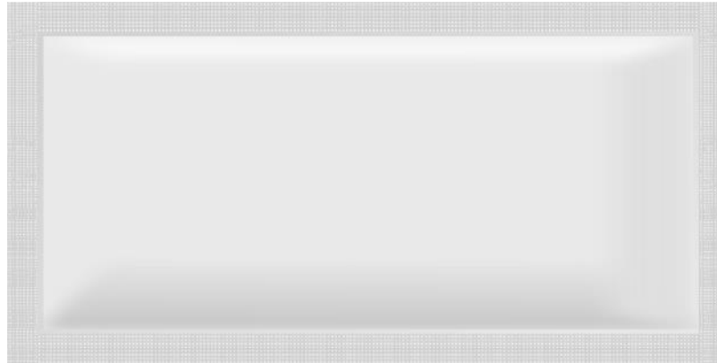
Size: 6 cm * 12cm