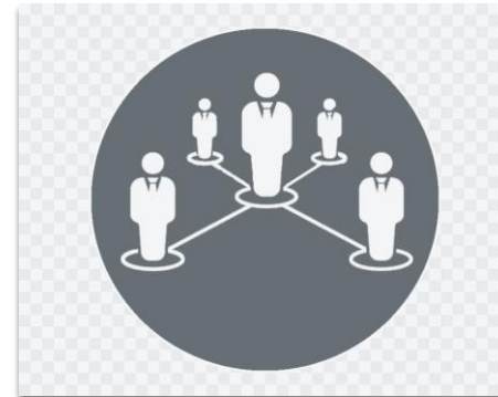
Teamwork (building a strong team to achieve common goals)