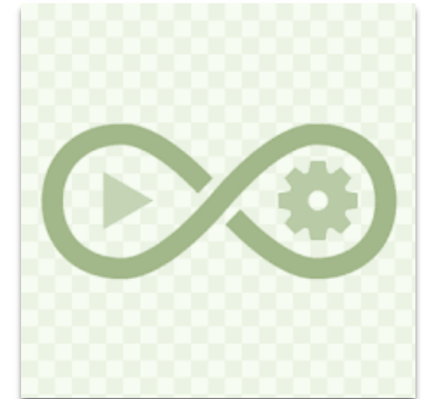
Development and continuous improvement